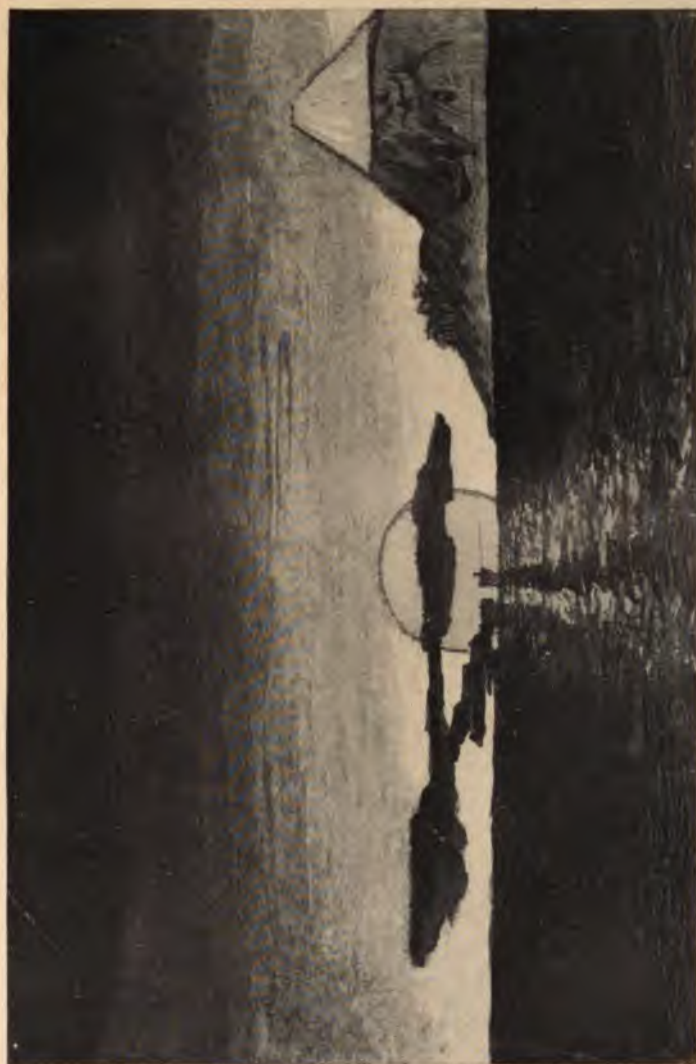
JAPAN From a sketch by Hearn