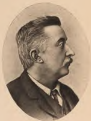
4 Lascadio Hearn