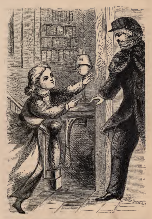
But it was too late; the study-door flew open, and Beth ran straight into her father's arms. — Page 320.