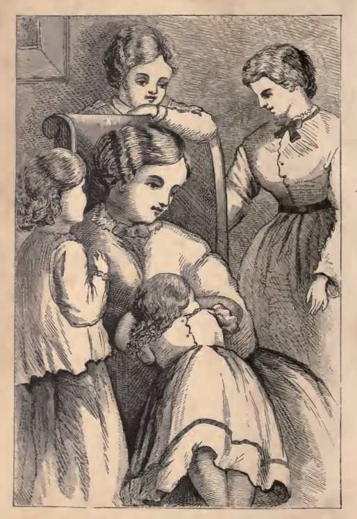
They all drew to the fire, mother in the big chair, with Beth at her feet; Meg and Amy perched on either arm of the chair, and Jo leaning on the back.—Page 12.