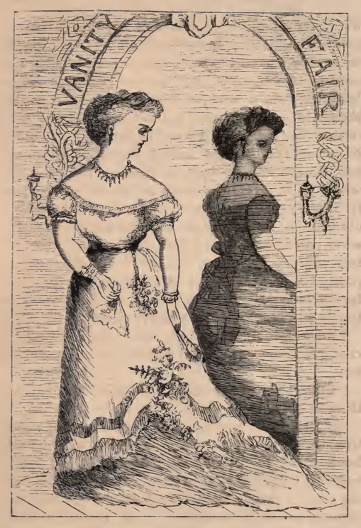
For several minutes, she stood like the jackdaw in the fable, enjoying her borrowed plumes. — PAGE 135.