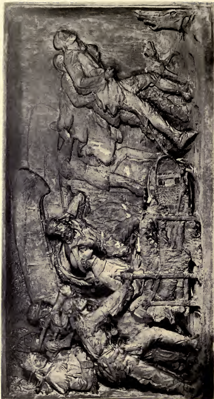
MARQUETTE AT THE CHICAGO PORTAGE