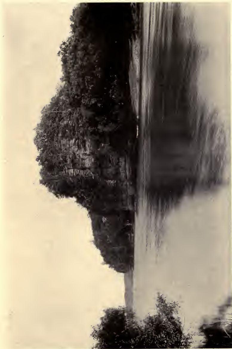
STARVED ROCK, THE SITE OF FORT ST. LOUIS