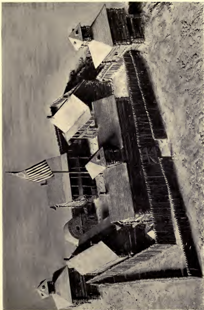
THE FIRST FORT DEARBORN, 1803-1812