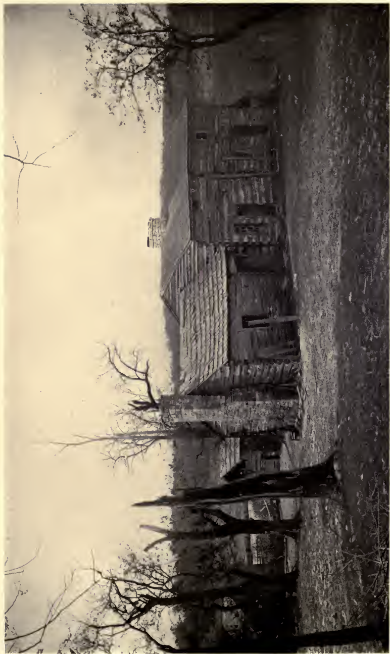
THE HEALD HOME NEAR O'FALLON, MISSOURI