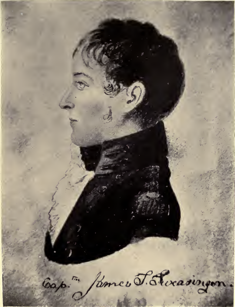
CAPTAIN JAMES STRODE SWEARINGEN

As a youthful lieutenant of twenty-one he led the troops to Chicago in 1803